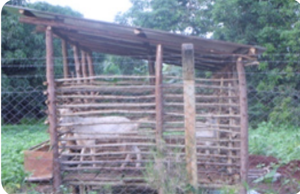
A dairy goat demonstration unit using locally available materials at Nakabango District Farm