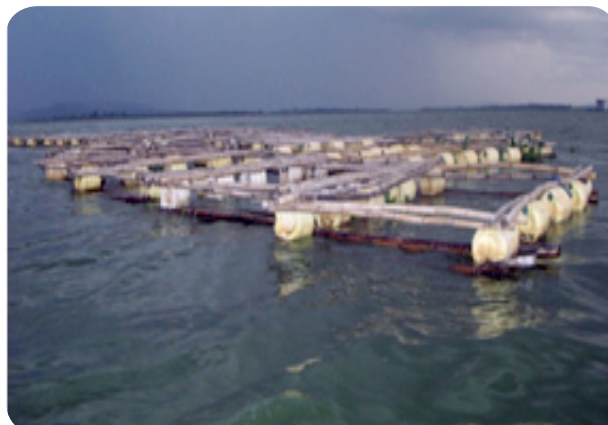
Fish cages made out of locally available materials (Bamboo) at Masese