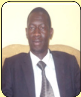
HON. WABIKA AYUB