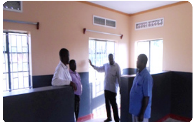
LEFT: Rear and side elevations of Lukolo Maternity ward RIGHT: Inside view of the facility