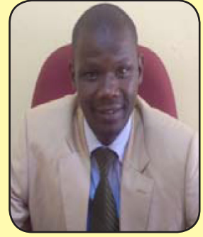
HON. MBENTYO MOHAMMED