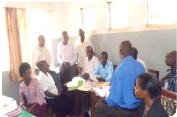
A team of HSD TB focal persons and DTLS giving feedback to staffs of Walukuba HC IV (Global fund TB support)