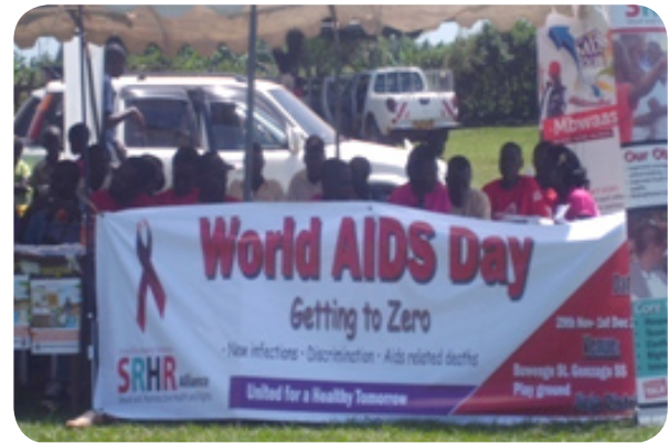
Members of JIDU people with disabilities sensitizing the community on HIV prevention