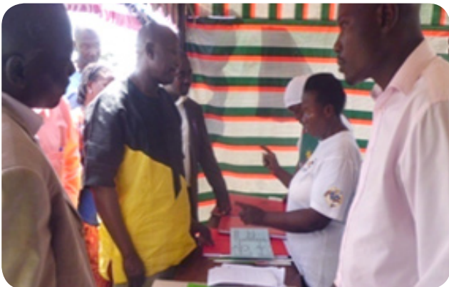
The LCV Chairperson listening to health worker during an HIV/AIDS campaign

Tb/Leprosy control section of the health department conducted several activities, which included:- Global Fund, TASO and PHC supported Technical Tb Support supervision to the 30 Health facilities that offer TB services, External Quality Assessment for TB diagnosis (District Lab Focal person and NTRL blinded re checking of Tb sputum smears done by the labs in the district), TB/Leprosy Surveillance and Quarterly reporting to MOH, NTLP M&E Office and TB/HIV collaboration.