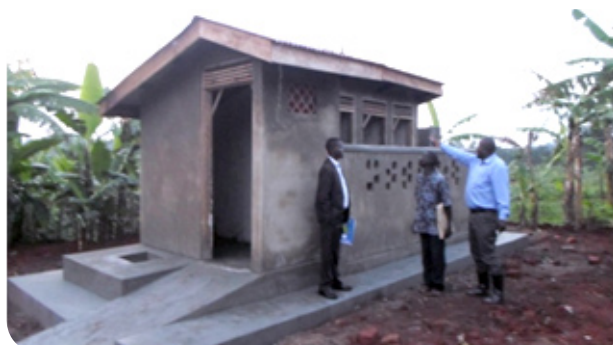
A 5-stance brick lined empty latrine with urinal at Busoona P/S