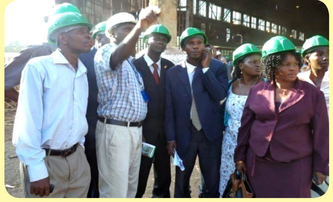
The Chairperson LCV and the District councilors during the tour to Kakira Sugar factory