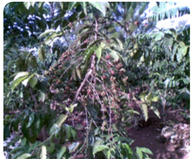
Ndegwe's coffee garden in Namata village Butamira Parish (NAADS)