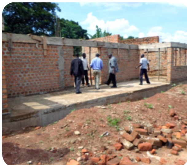
A maize mill under construction at Namagera Parish, Butagaya S/C (CAIIP Programme)