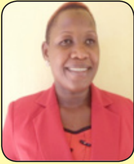
HON. KAWUMA FAZIRA