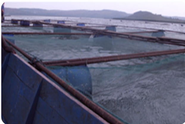
Commercial cage fish farming at Masese promoted by Jinja District fisheries