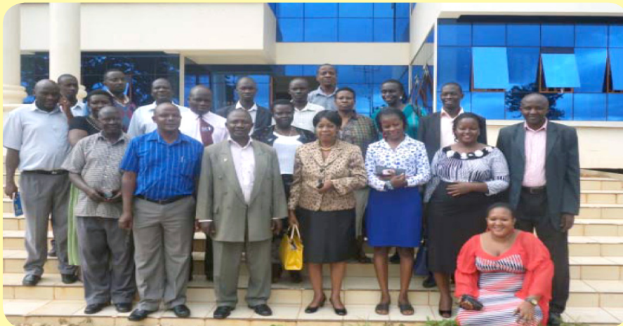
TOP: Jinja District team with the technical team from Kalangala In a group photo in front of Kalangala District headquarters