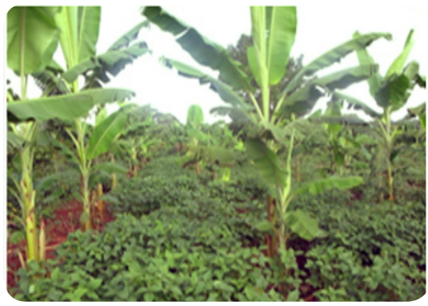
New banana garden for multiplication at Nakabango District Farm