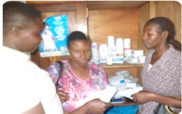
Some councilors from Education & Health committee during drug inspection in the Health Centres of Mafubira, Wakitaka and Bugembe.