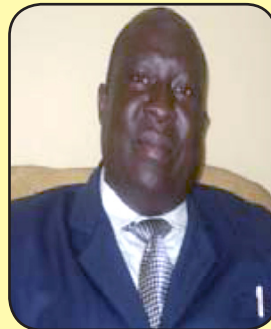
HON. LUYA GRACE