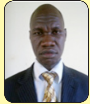
HON. NTAMBI KASSIM