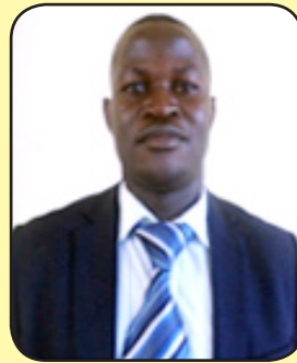
HON. KATUNTUBIRU M