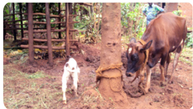
A heifer given to one of the groups