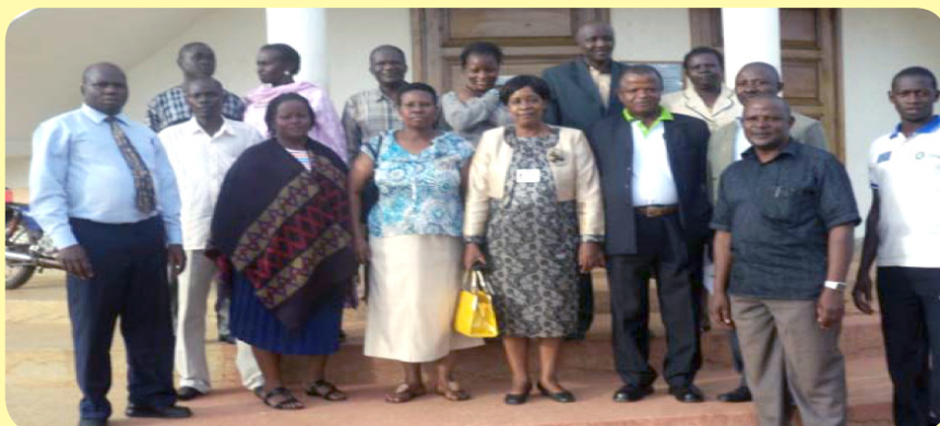
Jinja District team pose for a group photo with the CAO of Kyenjojo district in front of Kyenjojo district Head quarters