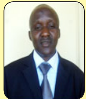
HON. TENYWA YAKUT