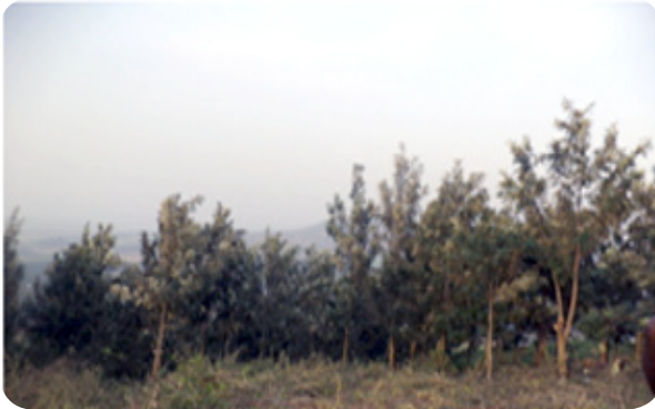
Tree planting along the River Nile