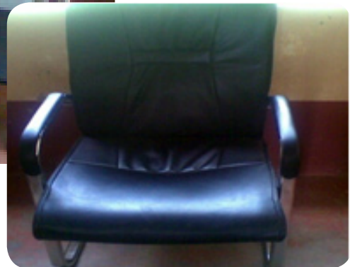
Office furniture for LC III Chairperson Under LGMSD