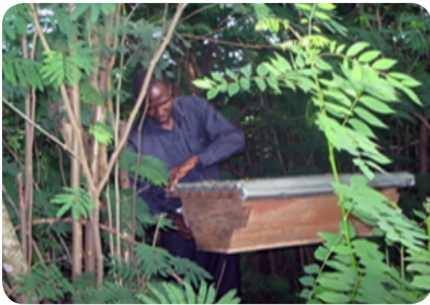
The Senior Entomologist during the inspection of the Bee hive at Nakabango District farm