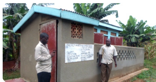
Clerk to council and Eng. Mwoga during the monitoring of a 5- stance brick lined empty latrine at Nyenga P/S