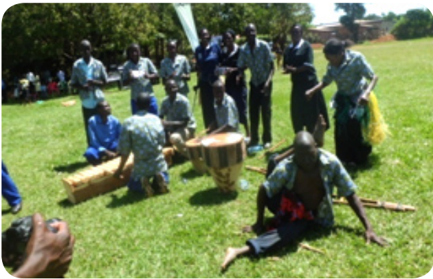
Some of the members during the Commemoration of World Aids day