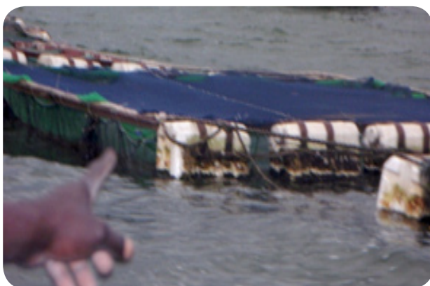
Fish cage demonstration units by the Jinja Fisheries Department at Masese