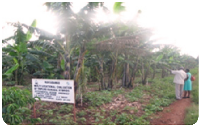
Research on Banana varieties for production and palatability at Nakabango.