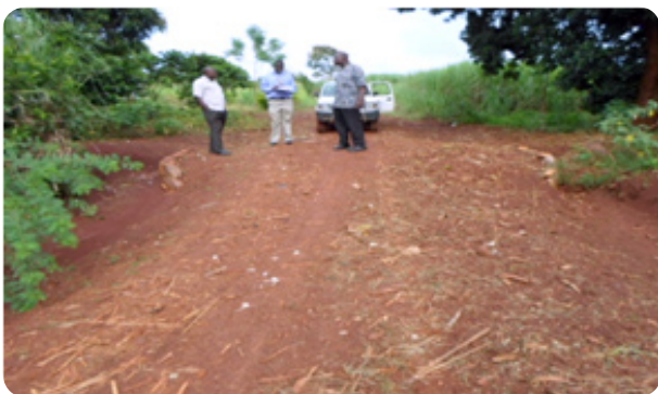
Tezita road-Hajat Musolo-Kainogoga road under CAIPII