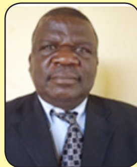
HON. MUTAASA PATRICK