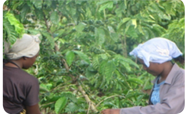
High yielding coffee at Nakabango District farm