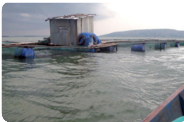
Commercial cage fish farming feed storage structure at Masese