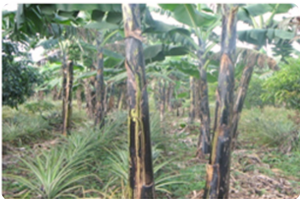
Inter cropping of Bananas and pineapple at Nakabango.