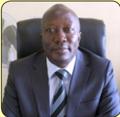
District Chairperson HON. NGOZI FREDRICK