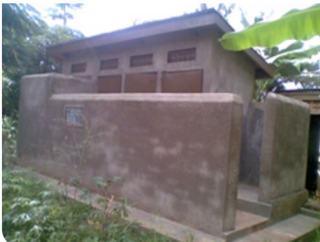
A four Stance Pit Latrine at Kamigo HC II