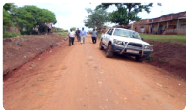
Lubanyi- Buwenge road implemented under force of account system