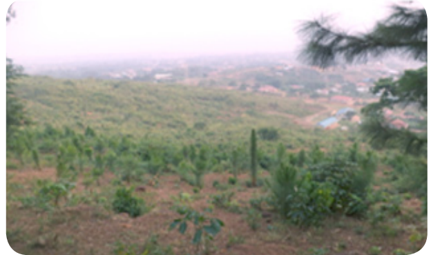
Tree planting at Wanyange Hill