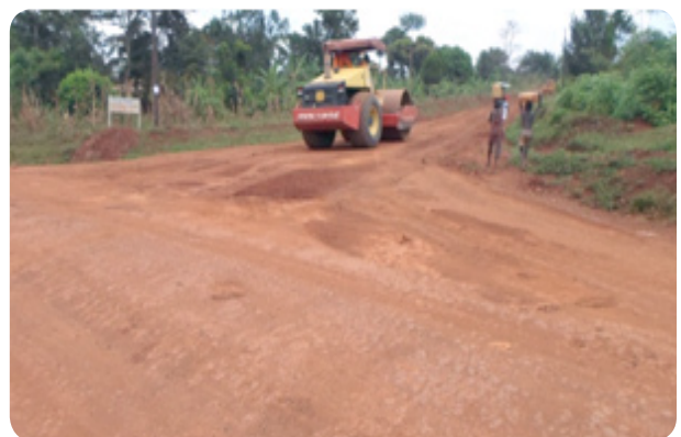
Compaction along Buwekula-Wanyange Road