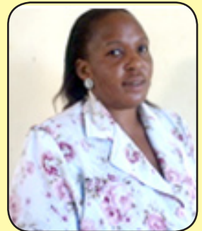
Sec. for Production HON. MUSIKA ANNET