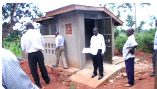
A 5-stance brick lined empty latrine with urinal at Buweera P/S