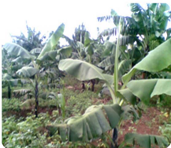
Advisable practice, Ssebagala Asuman, NAADS Beneficiary grows beans in banana garden