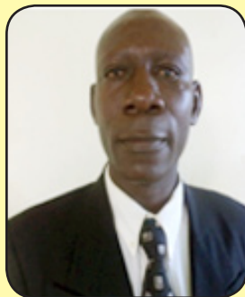
HON. MUGUMIRA ALOZIOUS