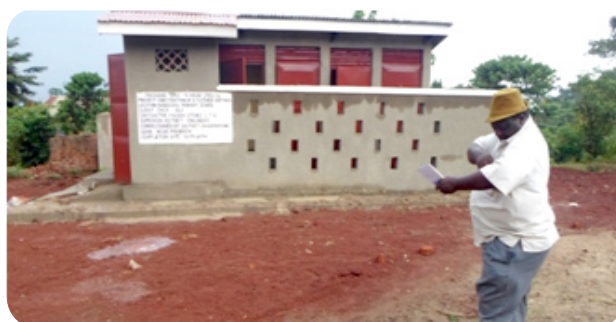
D/CAO, Begumya Eriab during the monitoring of a 5-stance latrine at Namagera P/S