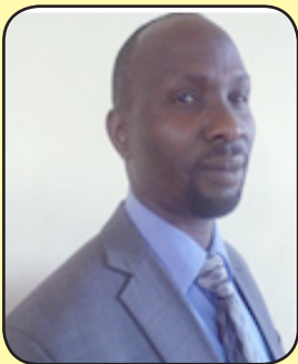
HON. MUWANIKA PETER