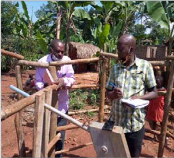
DISO- Jinja during the commissioning of a bore hole at Kigenyi Ismail, Kainogoga Village- Wanyange Parish