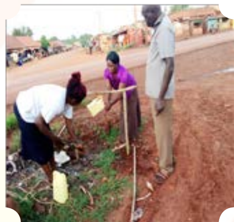
Demonstration of Setting up Tippy Tap for Hand washing in Ivuman-ba Trading Centre-Budondo Sub County where 30 people observed but at intervals