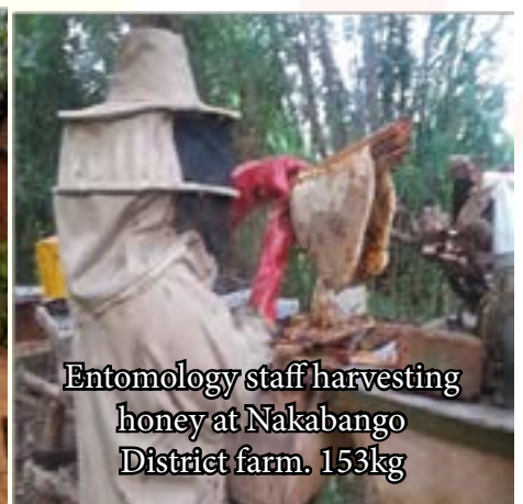
Entomology staff harvesting honey at Nakabango District farm. 153kg