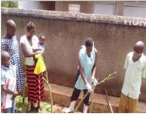
Kagera , Hand washing Demonstration by Health Assistant