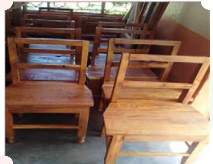
Provision of desks and classroom chairs for class teachers to government aided shools in Busede Sub County