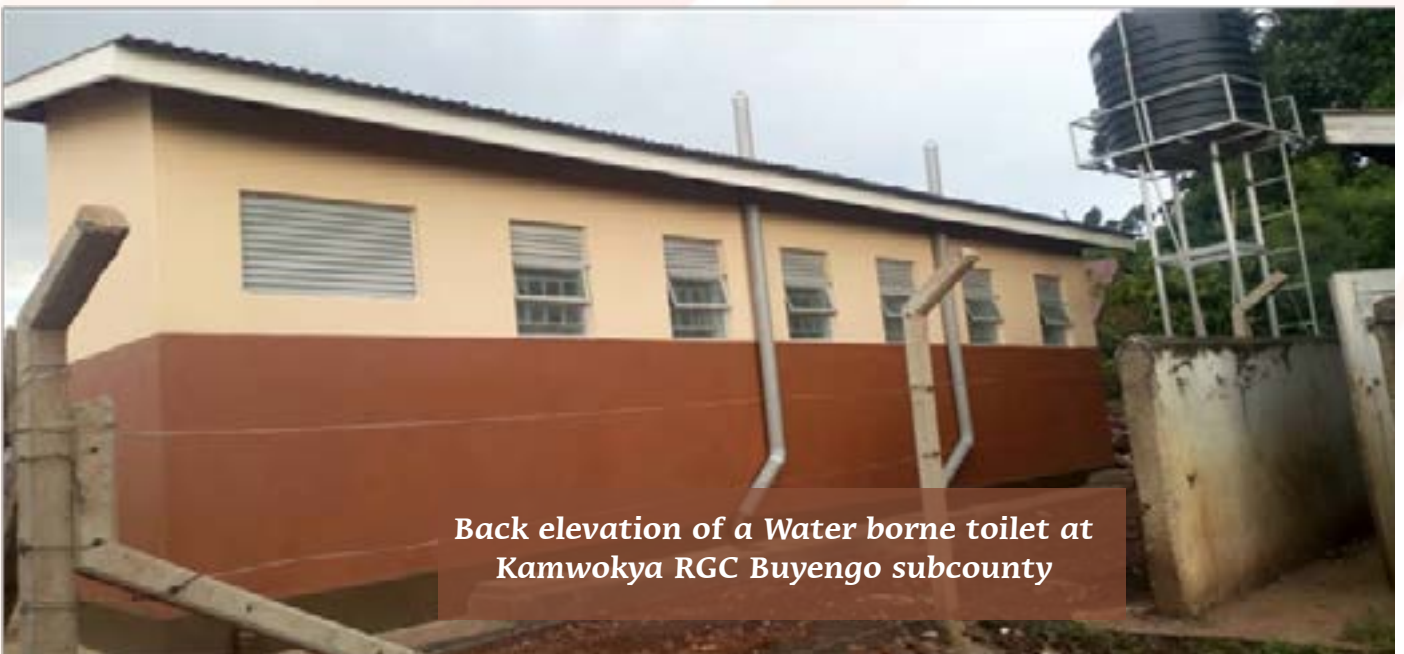
Back elevation of a Water borne toilet at Kamwokya RGC Buyengo subcounty