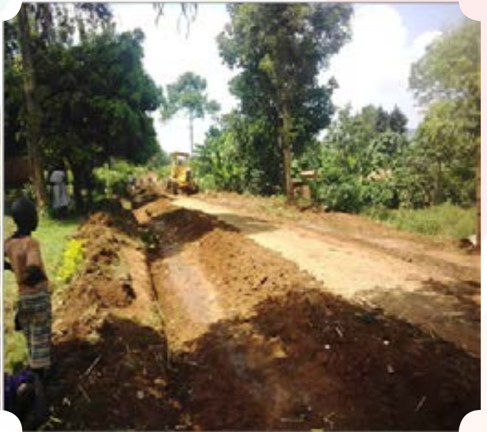
Grading of Kiiko – Budooma community access road in Nalinaibi Parish