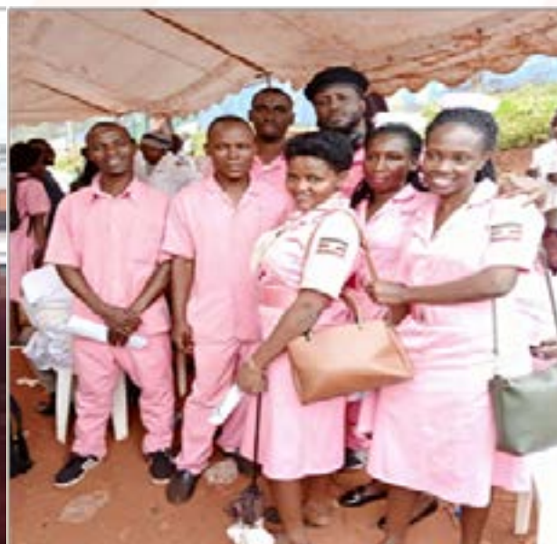
RT Nurses take off time for a selfie with Bebe Cool