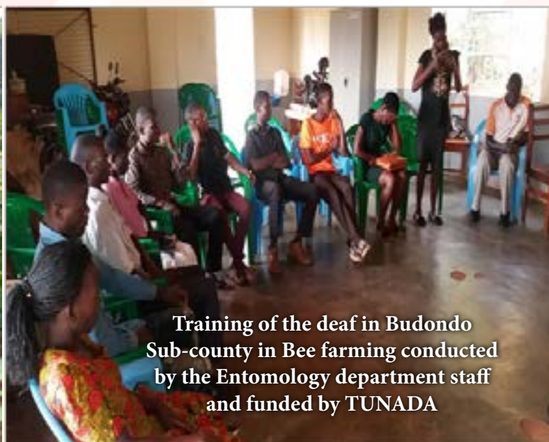
Training of the deaf in Budondo Sub-county in Bee farming conducted by the Entomology department staff and funded by TUNADA

Ssekamate a farmer engaging in coffee, cocoa and Bananas plus bee farming happy with how his coffee is performing after implementing the Good Agricultural Practices like stumping, pruning, manure application, pesticide application & integration with apiary