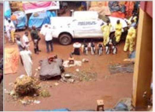
District Teams fumigating Jinja Central Market-for mosquito