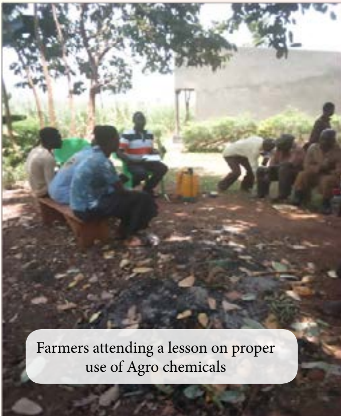
Farmers attending a lesson on proper use of Agro chemicals