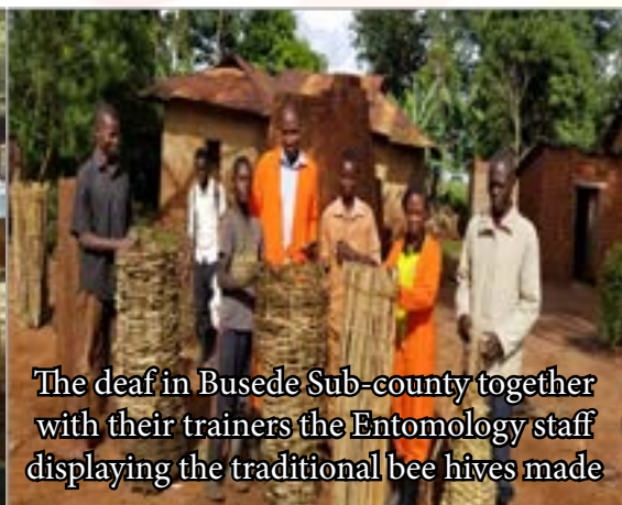
The deaf in Busede Sub-county together with their trainers the Entomology staff displaying the traditional bee hives made