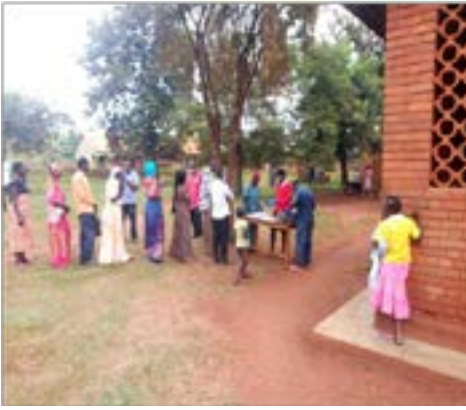
Distribution of SOUL Hope masks to patients at Budondo HC IV