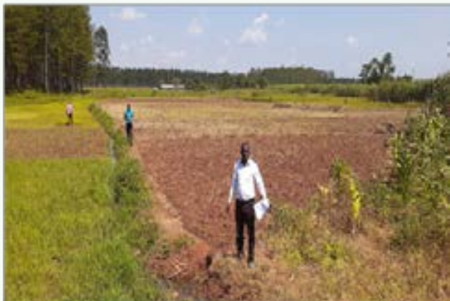
Fig 1: Cultivation of rice in a wetland in Namavundu, Nawampanda Parish Butagaya Sub-County

According to an Inventory carried out on wetlands in Jinja by the Ministry of Water and Environment in 1999, 12 Permanent Wetlands and 70 Seasonal Wetlands were identified. These contribute largely to the hydrological systems of the area. Most of them feed into River Nile. Encroachment remains a big challenge on these fragile ecosystems.