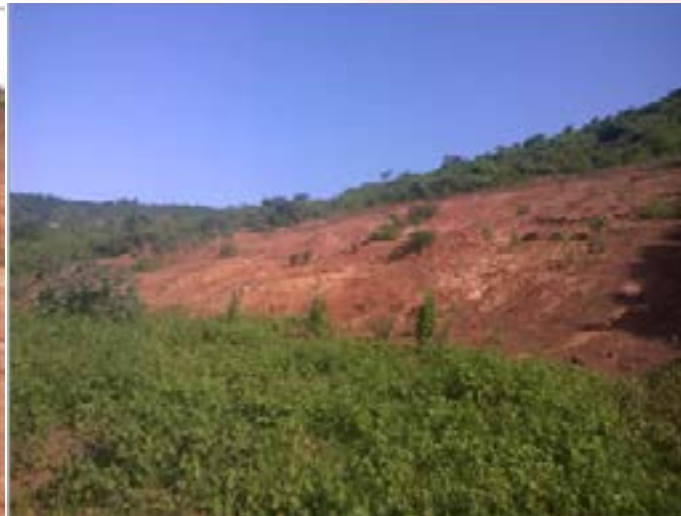
Fig: 6 A nearly restored site in Mwiri, Kakira Town Council.