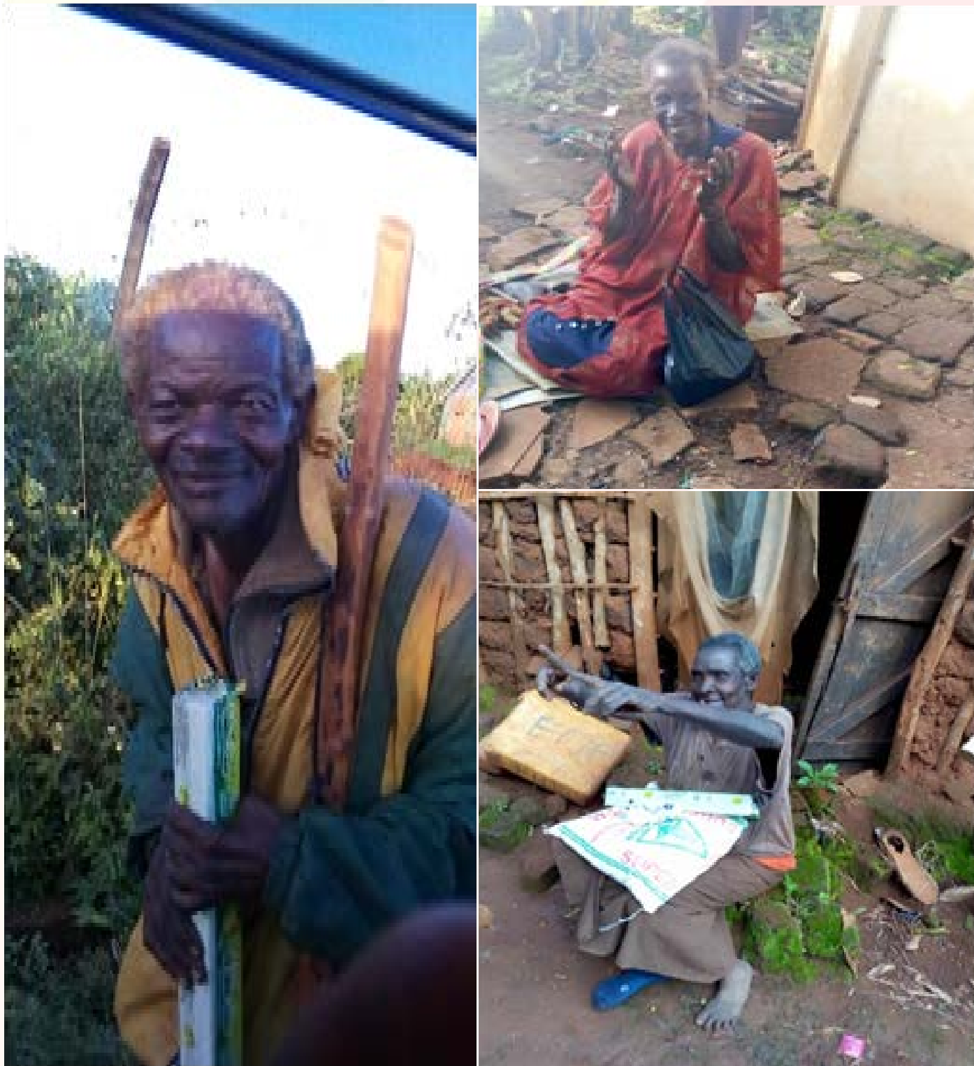
One of the 4,107 Senior citizens from Mafubira 101 years of age, Mpumudde division 82 years of age and Kakira Town Council 86 years of age respectively get very excited after being supported as elderly persons and roll out as SAGE beneficiaries from FY 2019/2020.