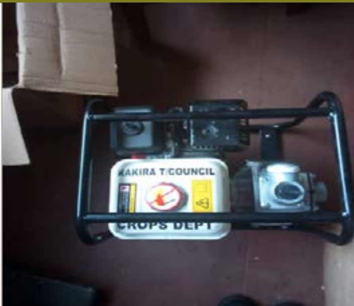
Mini irrigation component system