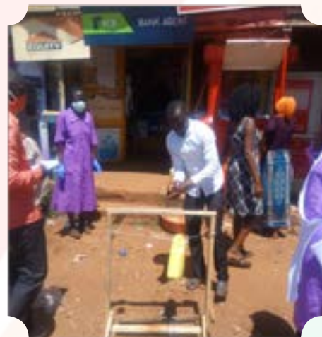
Kakira TC where eight people observed the demonstration