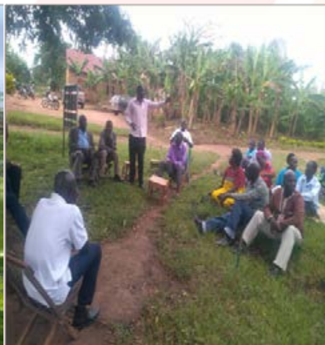
Coffee farmers from Buwenge S/c sharing experiences with their counterparts in Buyengo S/c on how to form a coffee farmers' Cooperative.