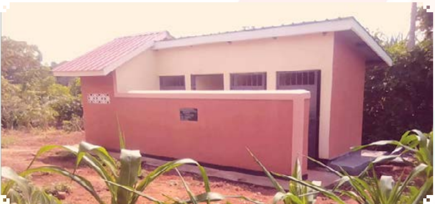
4 stance pit latrine constructed at Bufula P/S Budondo SC