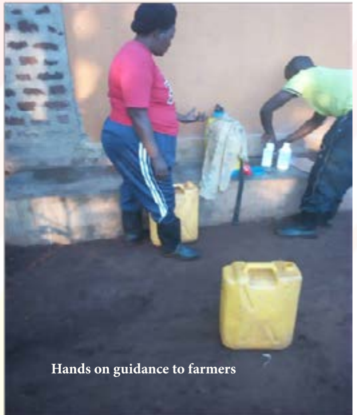
Hands on guidance to farmers