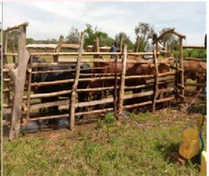
Communally grazed cattle being sprayed to control ticks and tsetse flies in Butamira, Buyengo Sub-county