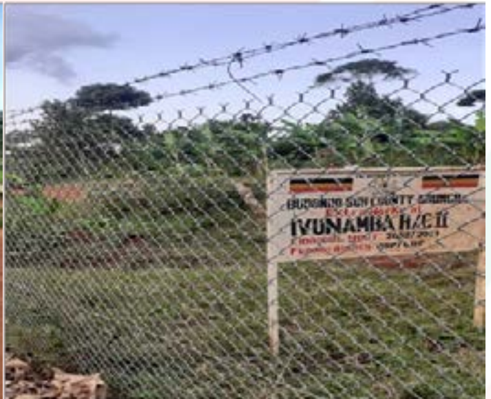
Fencing of Ivunamba HCII in Budondo Sub County