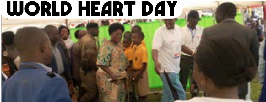
Speaker Kadaga inspecting the tents during World Heart day