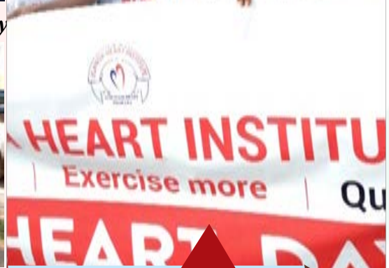
Miss Uganda Queen Abenakyo matching around town during the World heart day