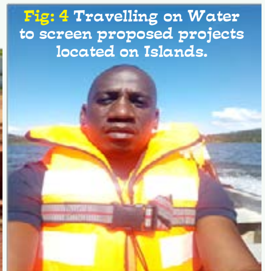
Fig: 4 Travelling on Water to screen proposed projects located on Islands.