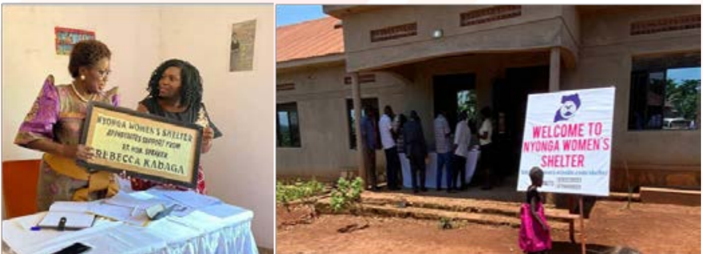
Rt. Honorable speaker Hon. Rebecca Kadaga visited the shelter to monitor its progress in January 2020. Shelter activities kicked off in February 2020