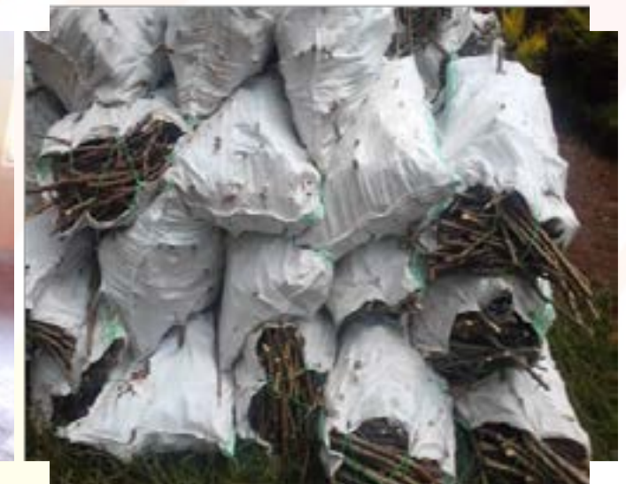
Cassava (Narocas 1) was distributed to farmers in 5 parishes of Busede subcounty