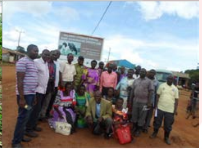
Executive members of Butagaya Dairy Farmers' Association & District plus Sub-county technical officers on a benchmarking visit to Balawoli Kyebajja To-Bone Dairy Farmers' Cooperative in Kamuli District.