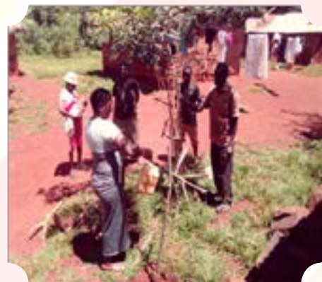
Demonstration of Setting up Tippy Tap for Hand washing in Nawan-goma where four people