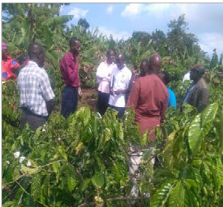
Coffee farmers from Buwenge S/c accompanied by their Agriculture Officer on a guided tour of Mugabo's model coffee plantation in Buyengo Sub-county