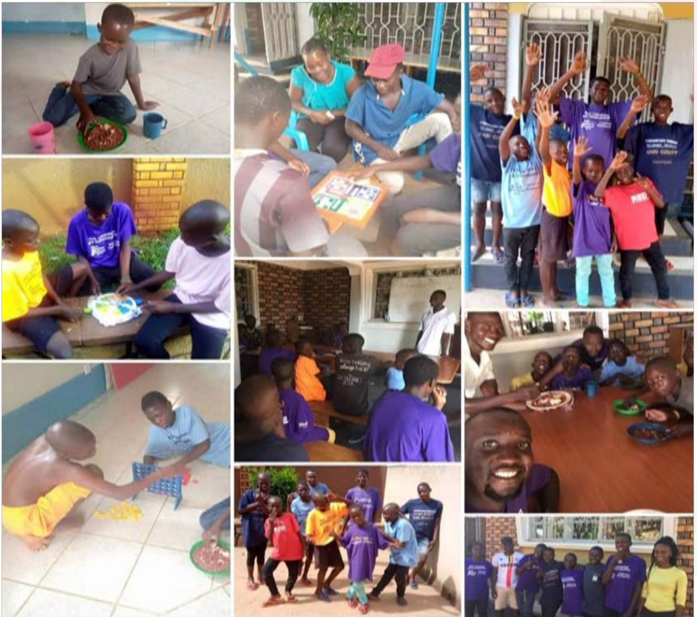
Street children rehabilitated at Kira Road during 3rd and 4th quarter 2019/2020 with support from civil society organisations such as SALVE