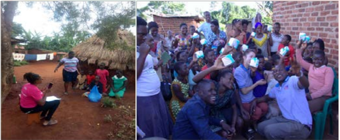
Irise Uganda supported young girls with reusable pads in Budondo and Butagaya Sub County while Teenage Mothers and child Support Foundation supported teenagers in Butagaya