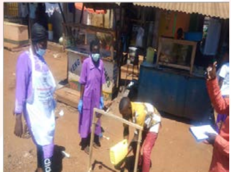
Demonstration of Setting up Tippy Tap for Hand washing by Health Assistants in Budondo SC and Kakira TC