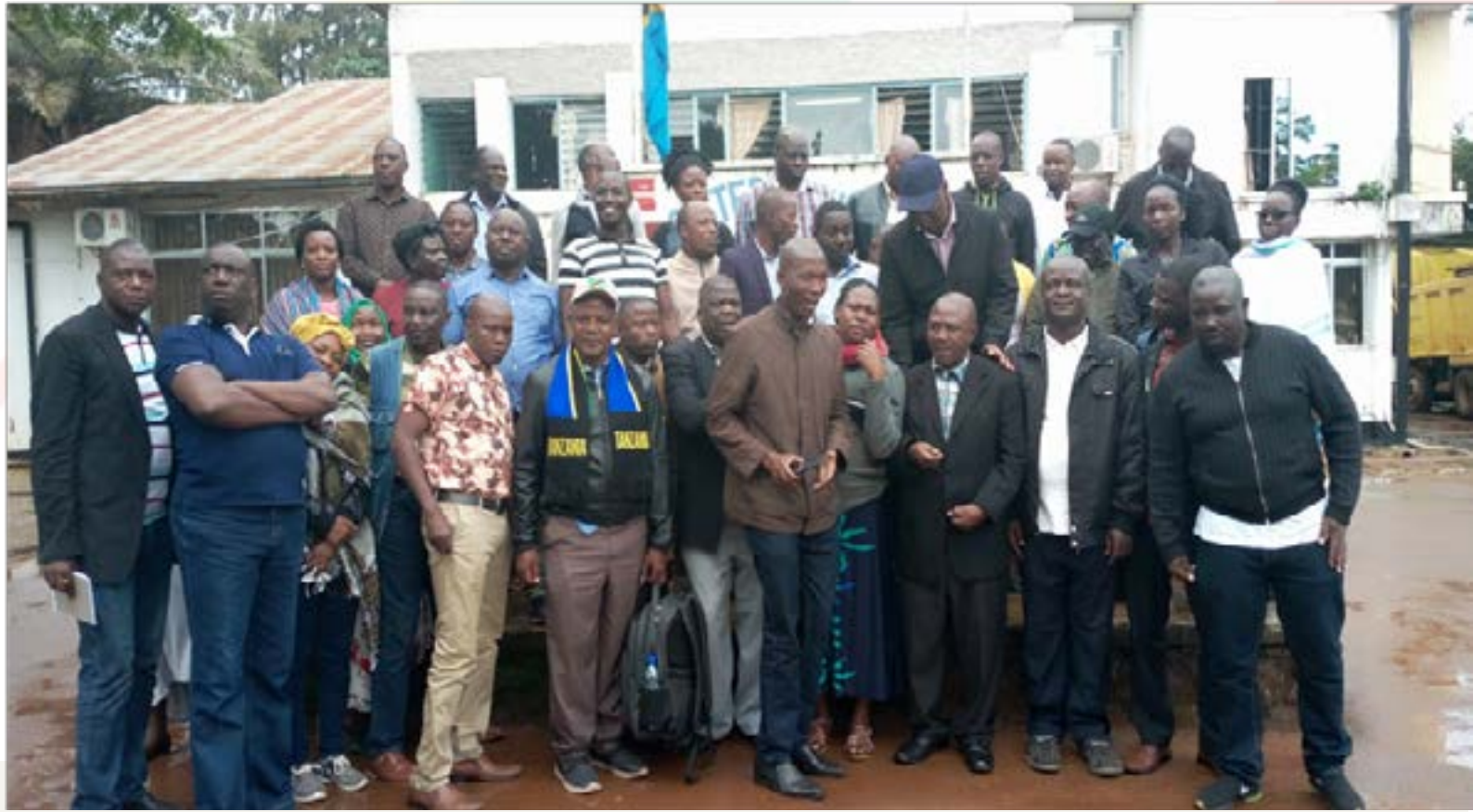
Councilors' and some technical staff's tour to Tanzania/Bukoba