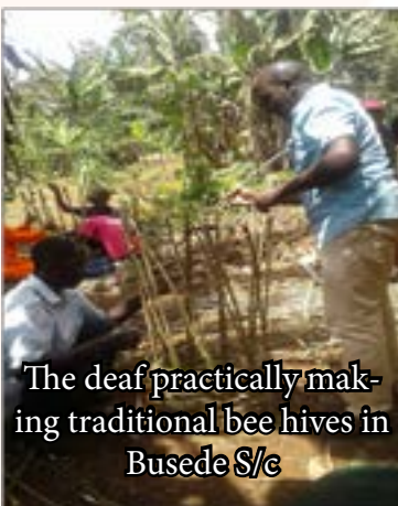
The deaf practically making traditional bee hives in Busede S/c