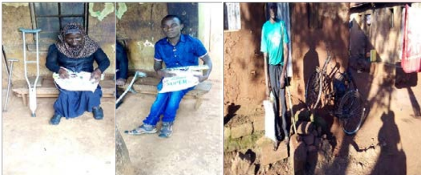
Persons with disability as a vulnerable special needs category reached out, sensitized and supported with food Aid during the covid 19 lockdown