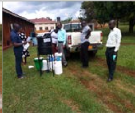
WASH/IPC COVID-19 Response Subcommittee delivering WASH equipment donated by ROTARY to Budondo HC IV