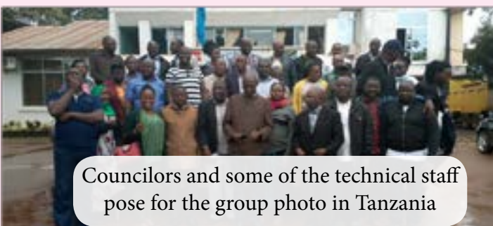
Councilors and some of the technical staff pose for the group photo in Tanzania