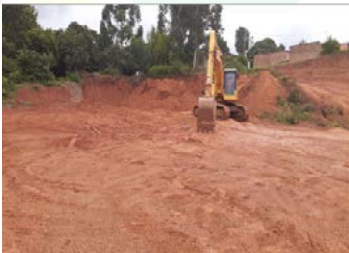
Fig 5: Restoration activities of a burrow pit.

Jinja is endowed with one of the best quality of Murram, a material commonly used for Road Construction. The increasing demand for this material has increased on a number of burrow sites in the district. Murram Mining comes with negative impacts on the environment and the communities that live near these burrow sites. The department has been keen on advising the contractors to always restore these sites on completion of works.