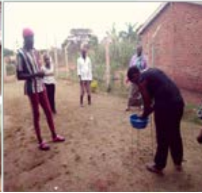
Demonstration of Setting up Tippy Tap for Hand washing –Lukolo TC