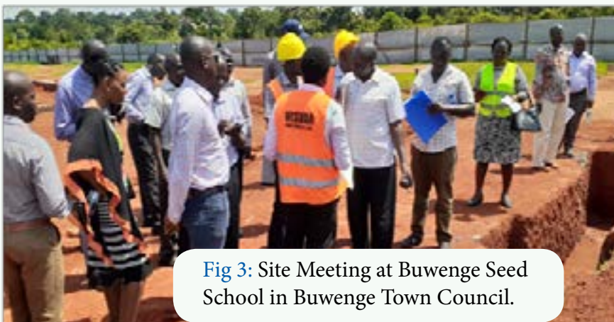
Fig 3: Site Meeting at Buwenge Seed School in Buwenge Town Council.