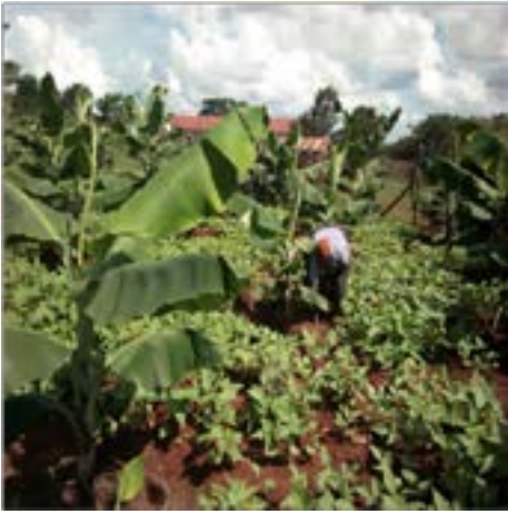
Adopters; this garden is a Kakira TC Project located at Kagowa PS