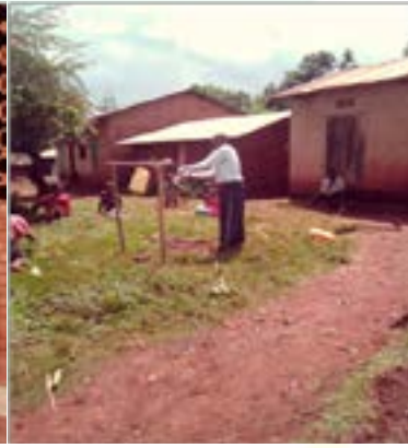
Demonstration of Setting up Tippy Tap for Hand washing at Kyomya in Budondo sc