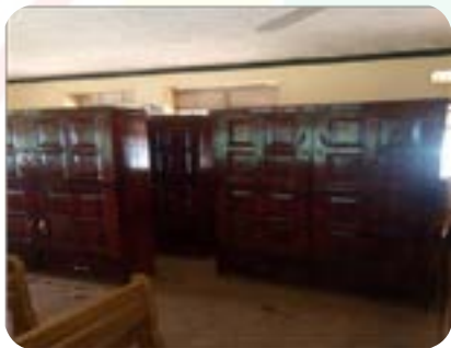
Procured 7 cupboards for primary schools