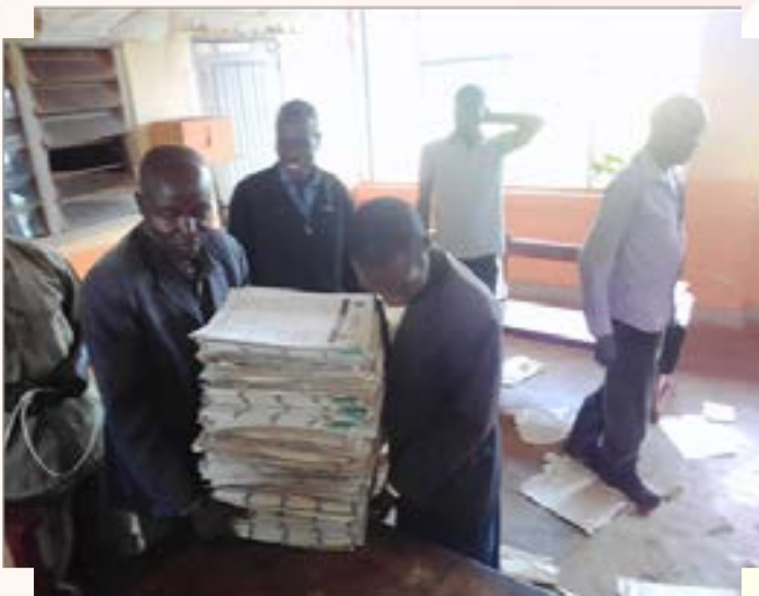
Reading materials were distributed to the local leaders in Busedde