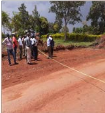
Road opening of Namaleno road connecting to Busoga College Mwiri Road