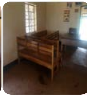
Procured 5 seater benches with back support for council