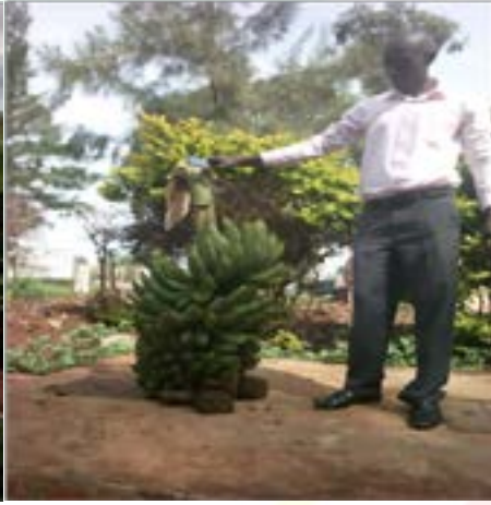
Some of the products from Kakira TC demonstration garden