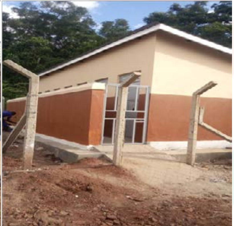
Water borne toilet at Kamwokya RGC Buyengo subcounty