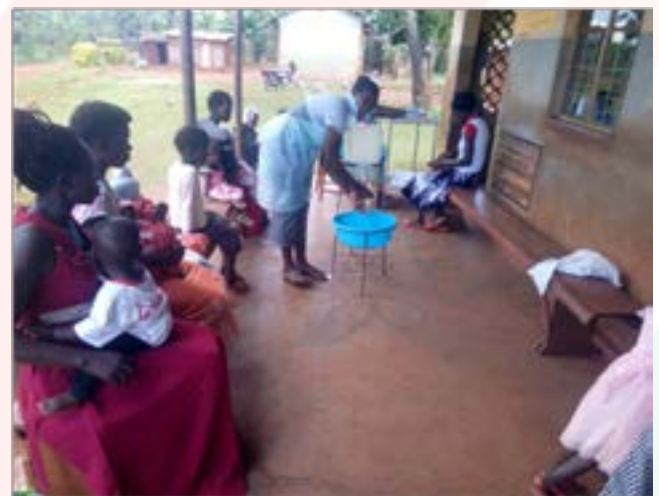
Busede HC III, Demonstration of Hand washing by ENV Health Staff.