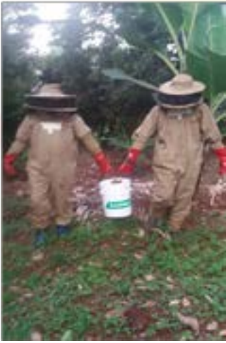
The Entomology staff after harvesting the honey. 153 kg of honey has harvested during this FY