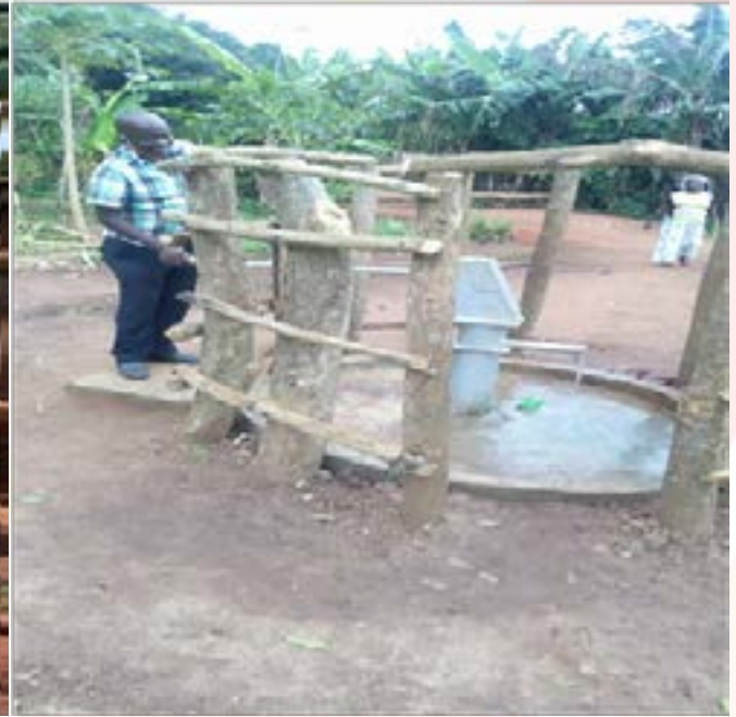
One of the boreholes at Matege Tigalya Willy Isiri village Kitanaba Parish Buwenge subcounty that were commissioned