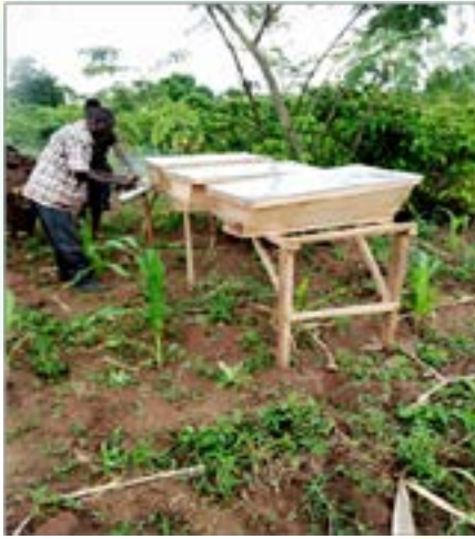
Fisheries staff carrying out assessments of a stocked fish pond in Kakira Town Council