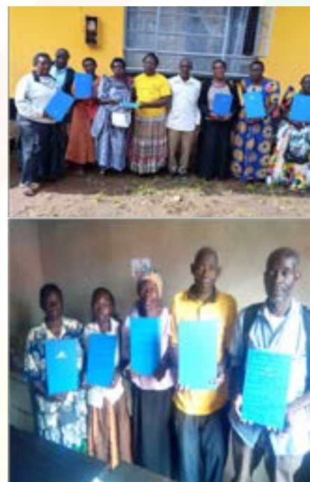
Functional adult literacy instructors from Buwenge Town Council and Butagaya Sub County receiving learner's registers from the CDOs

permanent markers, 400manila papers and 10reams