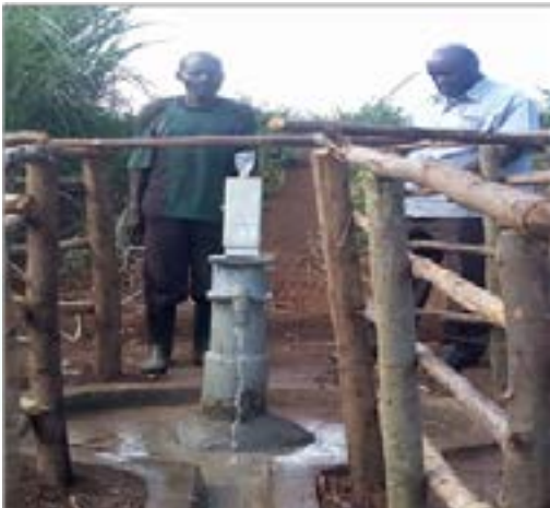
Eng.Mwembe and one of the beneficiaries testing the borehole after completion