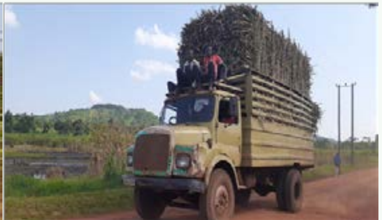
Fig: 2 A truck full of sugar cane. Sugar Cane growing remains a big factor contributing to wetland encroachment in Jinja.

According to the National Environment Act, 2019 and the National EIA Regulations , 1998, all proposed development projects are supposed to be screened for possible environmental and Social Impacts. The Department has always been keen on screening all the proposed district development projects. Over 50 Proposed Development projects were screened in the F/Y 2019/2020.